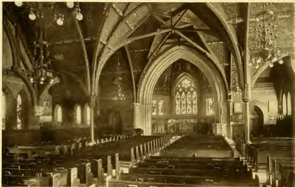
INTERIOR OF SAGE CHAPEL